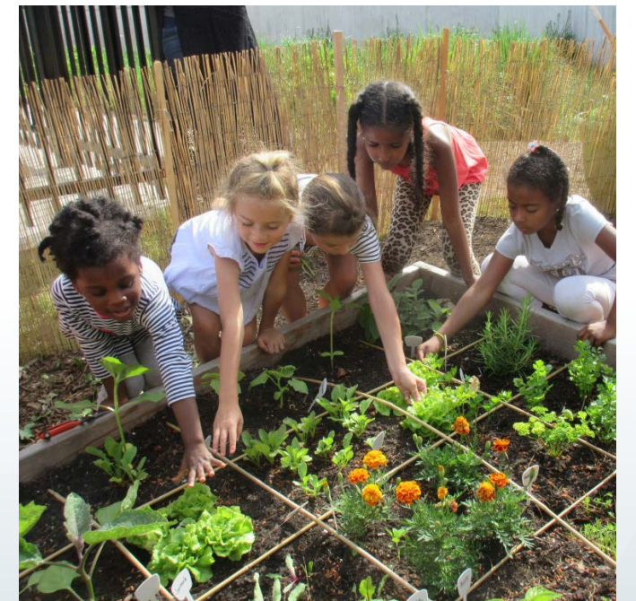
The Scotland Neighborhood Recreation Center, rebuilt in 2014, is the heart of the community. Box gardening outside the Rec Center with Everybody Grows, a local nonprofit.

Several recent attempts to rehabilitate the housing ended in frustration—that is, until the National Development Council began working with the residents and volunteer Board.