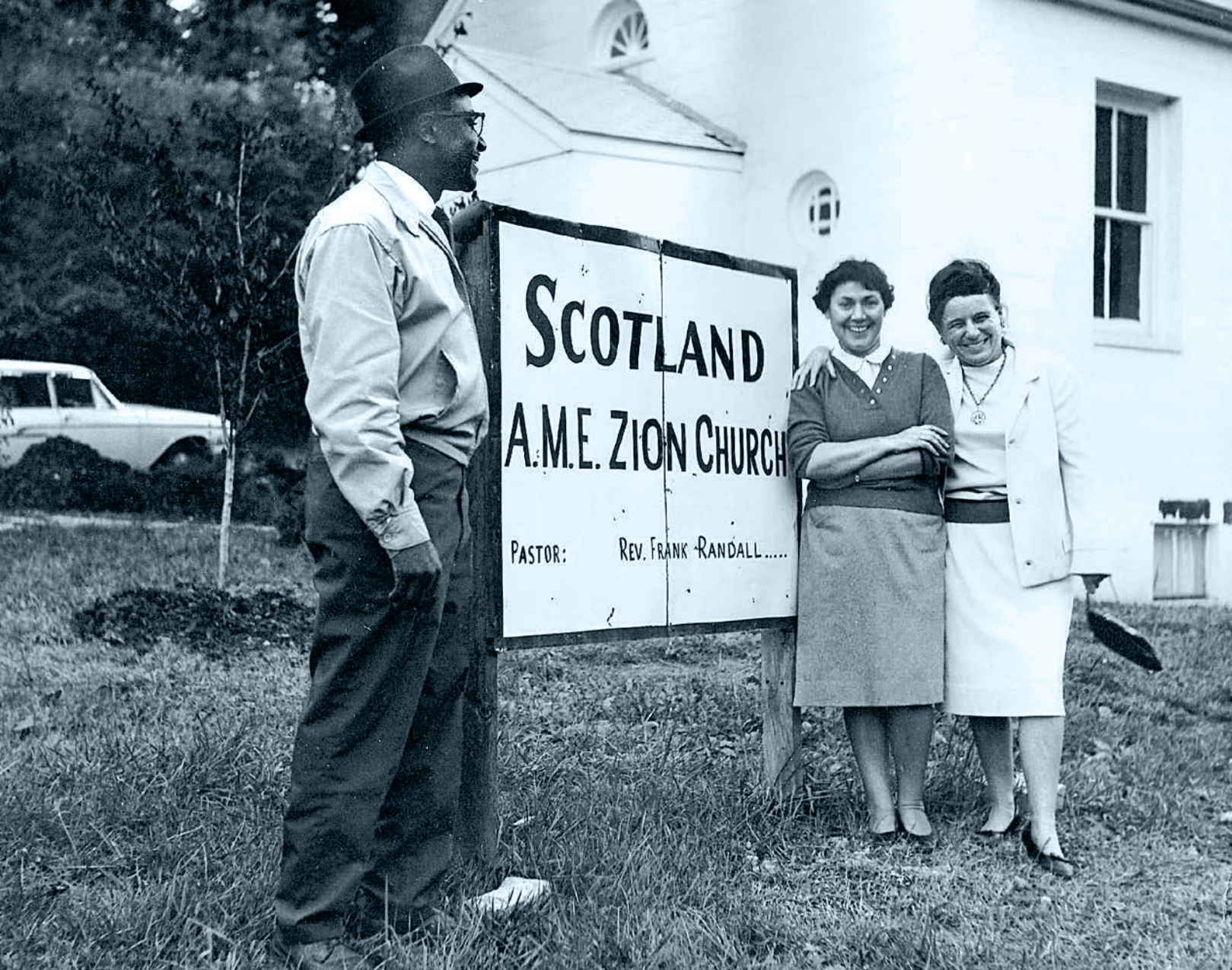
The historic Scotland AME Zion Church, built in 1905, still stands.